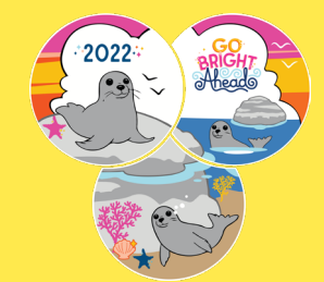
They fit together!